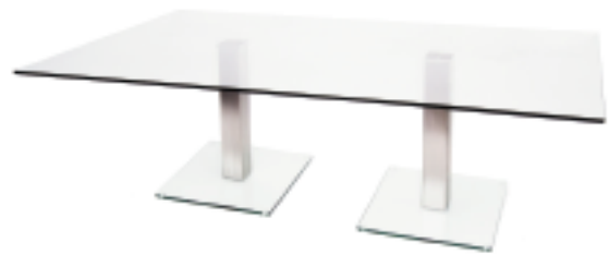
1500x900mm top with legs finished to stainless steel