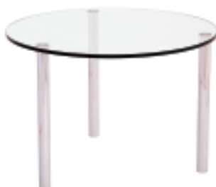
525mm diameter with Chrome legs