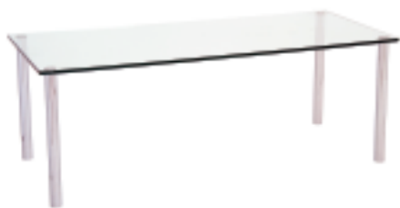
1120x500mm top with Chrome legs