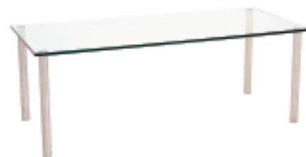
1120x500 with Satin Nickel legs