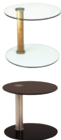
525mm version shown with black glass option