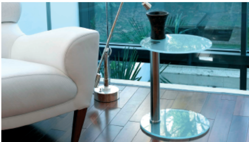
373mm stainless steel version shown with optional frosted glass